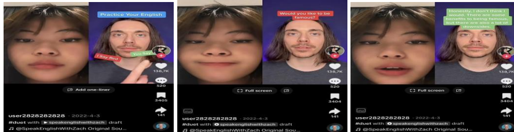
Figure 3. “Duet me” challenge

According to participants' answers, most participants found the “duet me” challenge as one of the TikTok’s features that can help them to facilitate practicing speaking. Figure 4 shows the sample of the duet me challenges.