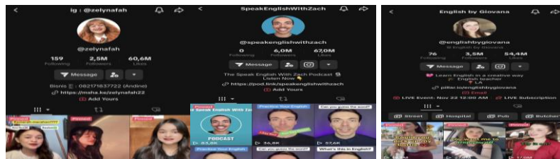
Figure 1. TikTok's content creators account

These are some TikTok's content creators that were mentioned by the participants. Three out of five participants mentioned @zelynafah as their favorite English content creator. One of the participants mentioned @speakenglishwithzach. And the last one mentioned @Englishbygiovana as her favorite English content creator. Figure 1 shows the account pages of the creators.